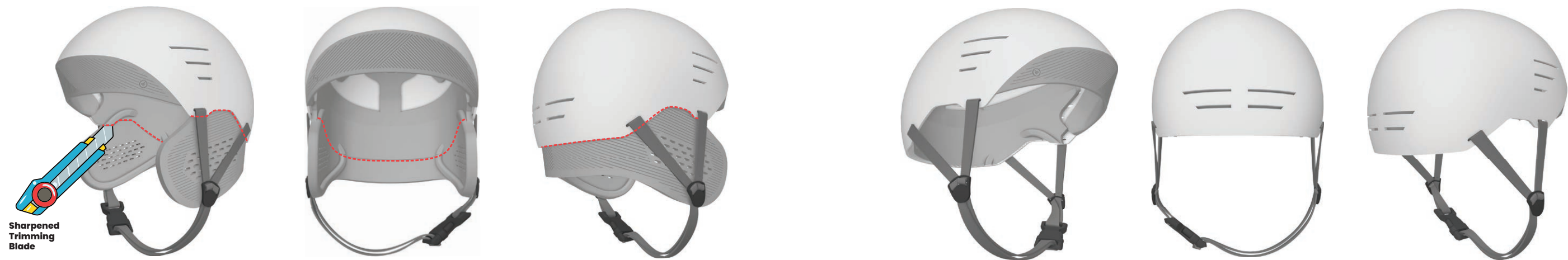
Sharpened Trimming Blade